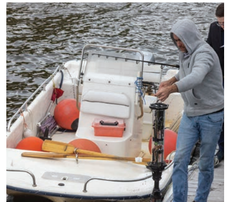
Aurelia Ocean Current Profiler being deployed off dock.