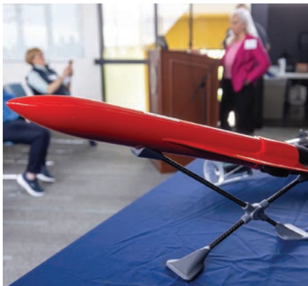
JAlA Technology's, JAlABot.