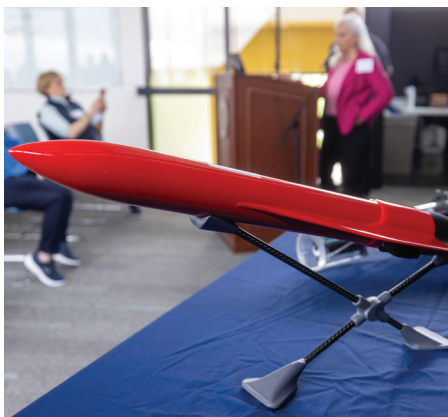
JAlA Technology's, JAlABot.