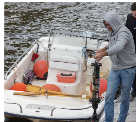
Aurelia Ocean Current Profiler being deployed off dock.